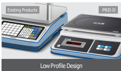
Low Profile Design

As a simple weighing scale with max. 1/30,000 resolution, PR-IID/DU is suitable for various industrial environment, including market & shop with a low-profile design.